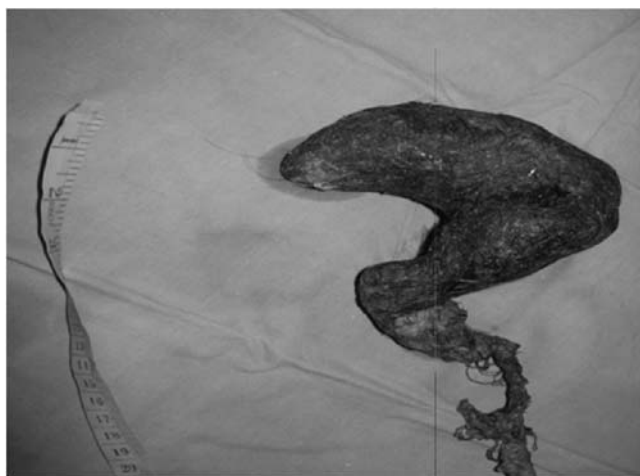
Figure 2 Bezoar extending beyond stomach