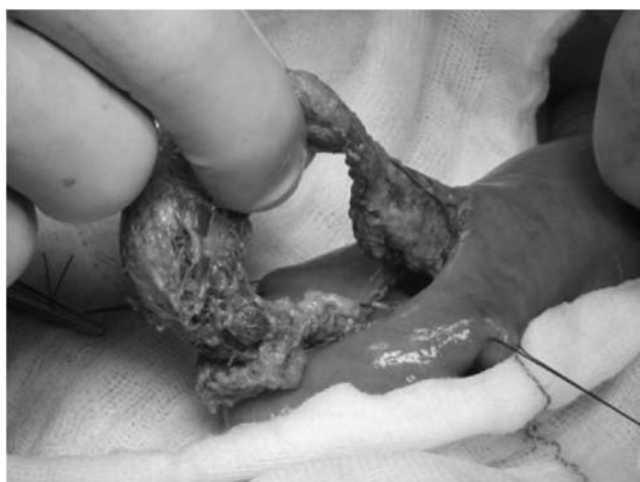
Figure 1 Bezoar in stomach coated with food particles during surgery

She was referred to paediatric surgeon, evaluated, her basic investigations were done; haemogram was significant for anaemia. Patient was planned for surgery with the impression of intestinal obstruction secondary to intestinal bands or meckel's diverticulitis which is more common in children, surgeon approached from the small intestine on exploration found collection of mass of tuft hair which was traced from the ileum till the stomach (Figures 1, 2, 3).