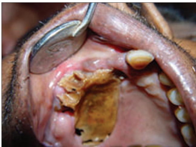
Figure 5: Intraoral photograph showing necrosis of palatal bone