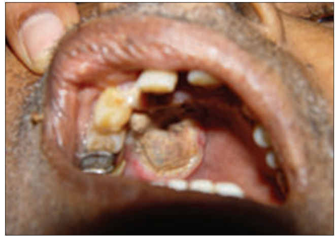
Figure 2: Intraoral photograph of the patient shows ulcerative lesion covered with yellowish slough with everted borders