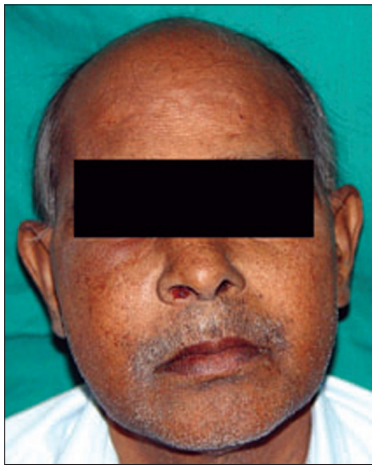
Figure 1: Extraoral photograph of the patient shows swelling on right middle third of the face and brownish discharge from the right nostril