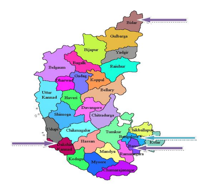
Figure 1: Map of district visited.

Hence the present study was done with the objectives to evaluate the activities of NVBDCPin state of Karnataka and to enumerate and critically analyze selective qualitative and quantitative indicators.