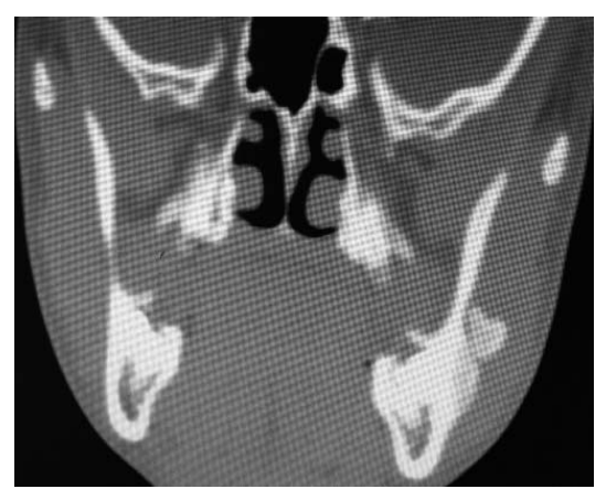
Figure 2b and 2c: Axial section (Figure 2b) and coronal reconstruction (Figure 2c) CT image (bone window) showing hyperdense lesion in the left masseter muscle abutting the angle and ramus of mandible.