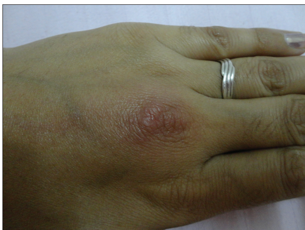
Figure 1: Curvilinear, faintly erythematous plaque with surrounding edema over the dorsum of left hand

Following the excision, the swelling and irritation subsided. The patient did not develop any systemic or psychiatric symptoms. Blood mercury levels were not measured.