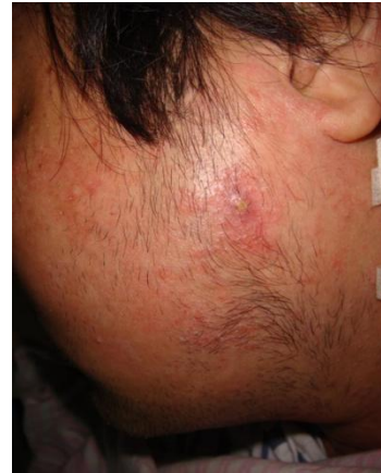
Fig. 1. The patient's fistula and swelling from mandibular osteomyelitis in his left cheek

attacked by these again two months ago, with rashes on his whole body. And there was no effect even after taking above medicines. What was worse, rashes and itching increased significantly in the past 2 weeks. So, he was enrolled as an inpatient to receive further therapy being diagnosed as "regular Psoriasis". Additionally, he received two times of Abscess incision surgery in his left face one month ago and then was extracted his left first mandibular molar 2 weeks ago. There were swelling and pain in his left face 2 days ago, with moderately limited mouth opening that was only 27 mm width, he also got a small bug shape swelling of 1.5 cm in the skin, yellow and soft of the left cheek (Fig. 1). Fistula and pus discharge could be seen in the oral vestibular of the left mandibular molar. Besides, he had got anaemia for more than 10 years and hepatitis B over 20 years, with a normal liver function that was checked regularly. After incision and drainage treatment as well as anti-infective medicine, he recovered much with reduced swelling.