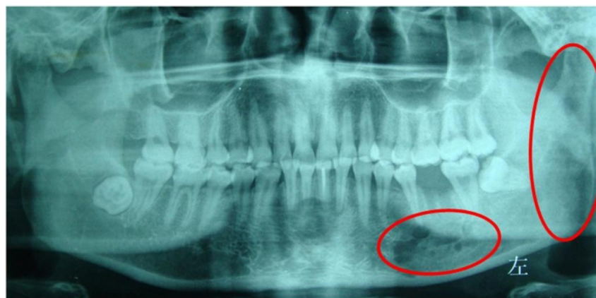
Fig. 3. Panoramic X-ray of his mandible and maxillar showed his left madibular osteomyelitis