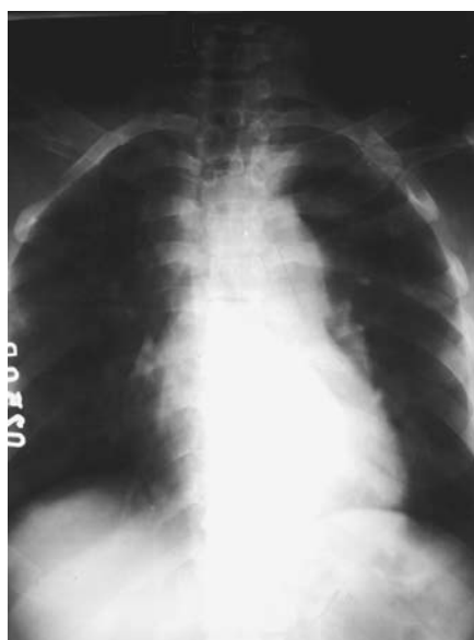
Fig. 5 : Chest X-ray AP view showing retrocardiac shadow