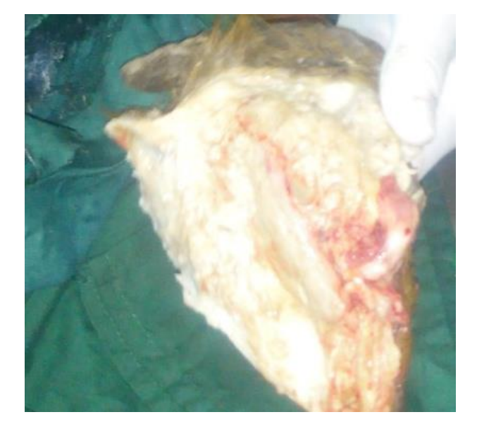
Figure 6: Removal of gangrenous part of the mammary gland.