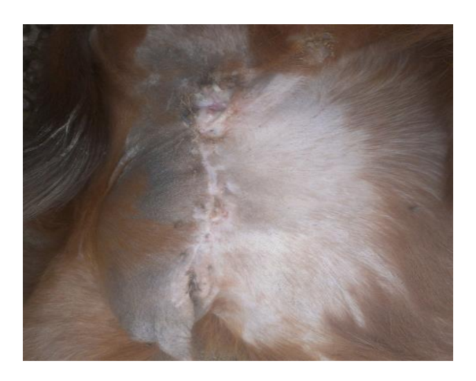
Figure 10: 16 days post-surgery.