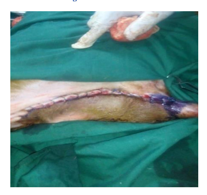
Figure 9: Skin closure.