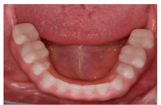
Figure 6- Final prosthesis following insertion.

22. The final prosthesis was processed, finished and polished. The laboratory remount procedure was performed, intraoral occlusion, tissue adaptation/contours, comfort and esthetics checked, and adjusted as needed. Implant fasteners were torqued appropriately, and screw access openings sealed. (Fig. 6)