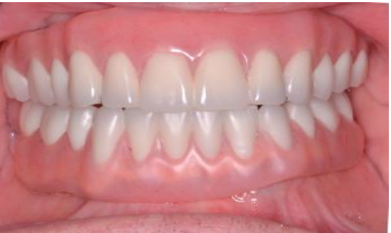
Fig. 5 Esthetic trial of mandibular set up on original prosthesis bar, with border extensions to be modified for oral hygiene access.

21. Trial insertion is now performed, (Fig. 5) if desired, and any required modifications made.