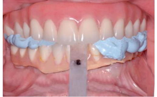
Figure 1- Making centric relation record with leaf gauge.

A centric relation record was made at the appropriate occlusal vertical dimension with a polyvinylsiloxane (PVS) occlusal registration material (Blu-Mousse Classic, Parkell Inc, Edgewood, NY) utilizing a leaf gauge (Huffman Leaf Gauge, Huffman Dental Products LLC, Springfield, OH) as an occlusal stop. (Fig. 1) Standard disinfection protocol was followed throughout the procedure.