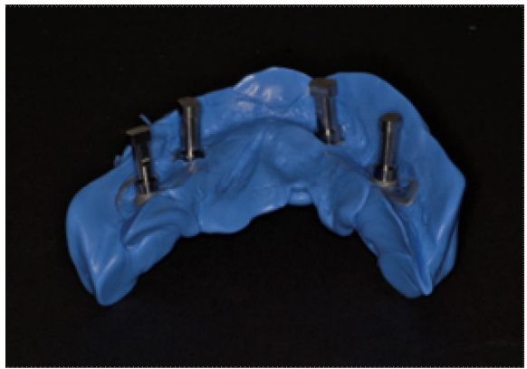
Fig. 3 Implant analogs fitted to impression

11. Implant replicas were attached to the prosthesis with laboratory screws, and complete seating confirmed (Fig. 3).