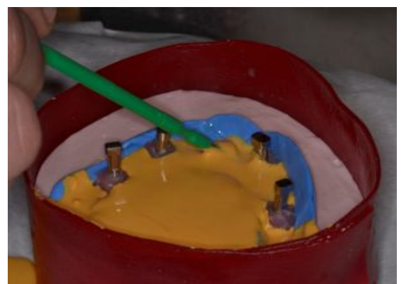
Fig. 4 Master cast being poured following addition of soft tissue replica material and boxing

14. The impression attached to the prosthesis was boxed and poured (Fig. 4) with type IV dental stone (Prima-Rock Die Stone, Whip Mix Corp.).