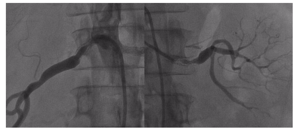
Fig. 1. Selective renal angiography showing bilateral in-stent restenosis

hemodialysis. When reduced glomerular filtration rate (GFR) and high risk of atherosclerotic disease are present mainly in hypertensive patients, it seems prudent to examine renal arteries. The choice of the best method for evaluation should according to the probability and severity of ARAS. Renal artery Doppler ultrasound may be useful in patients with elevated creatinine as there is no need to use contrast. Renal angiography is the gold standard for high-risk patients, even with reduced GFR, where selective renal artery catheterization should be indicated. Antihypertensive drug therapy should be managed progressively as needed to achieve the individual blood pressure target. If adequate BP cannot be achieved and/or high-risk conditions are present such as refractory hypertension, progressive renal dysfunction and/or episodes of circulatory congestion, it is recommended moving forward with characterization and restoration of the renal supply.