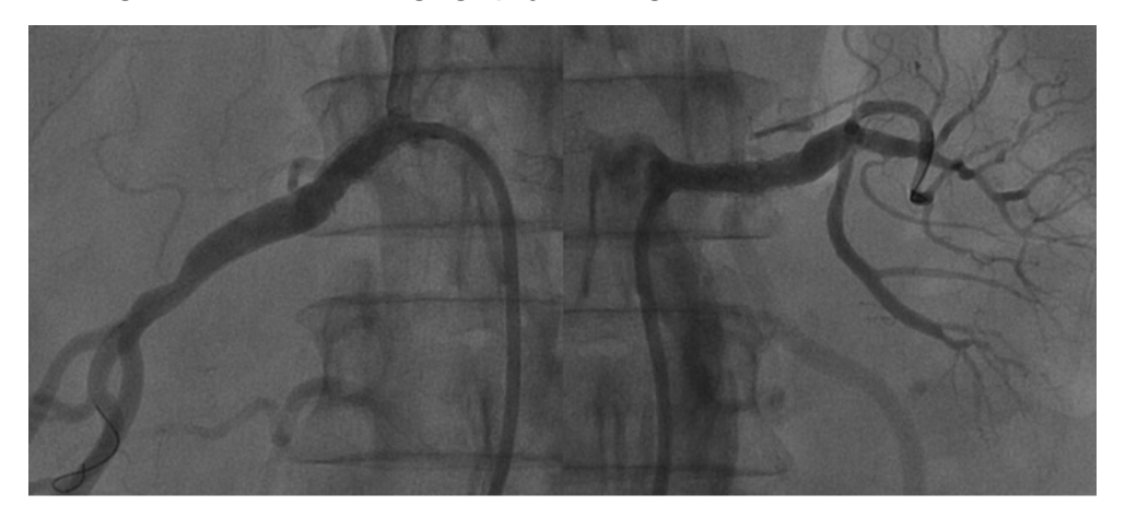
Fig. 2. Selective renal angiography after bilateral balloon catheter angioplasty