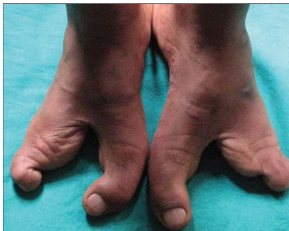
Figure 7: Congenital disorder of feet of the subject's brother

The subject's father and brother were also diagnosed with generalized aggressive periodontitis.