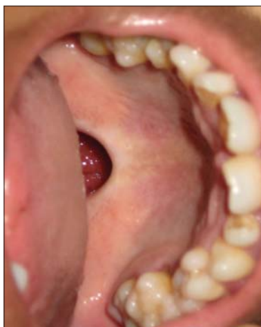
Figure 9: Intraoral photograph of the patient demonstrating soft palate cleft with missing uvula of patient