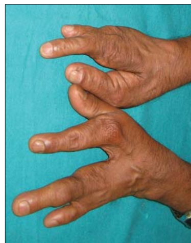
Figure 4: Congenital disorder of hands of the subject's father