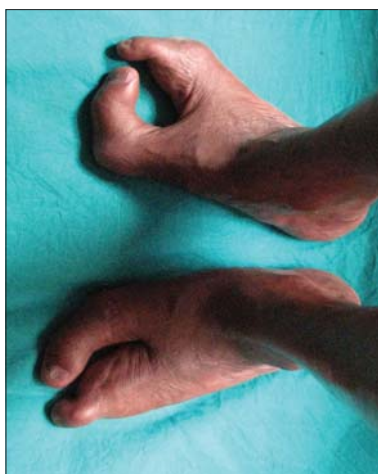
Figure 5: Congenital disorder of feet of the subject's father