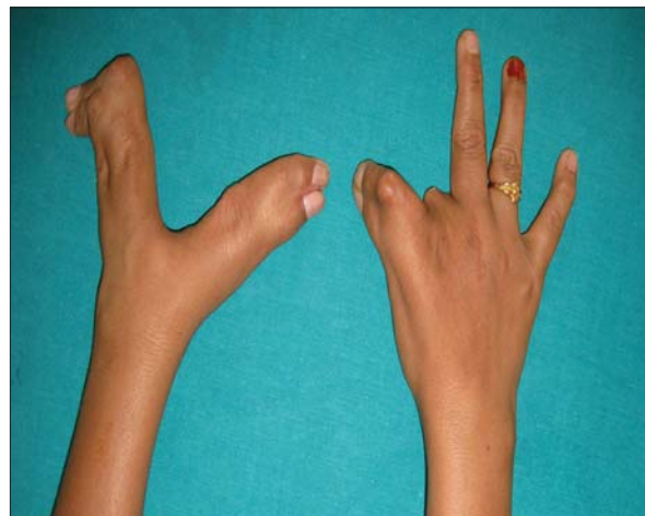
Figure 2: Hands with syndactyly, clinodactyly, and ectrodactyly of female patient