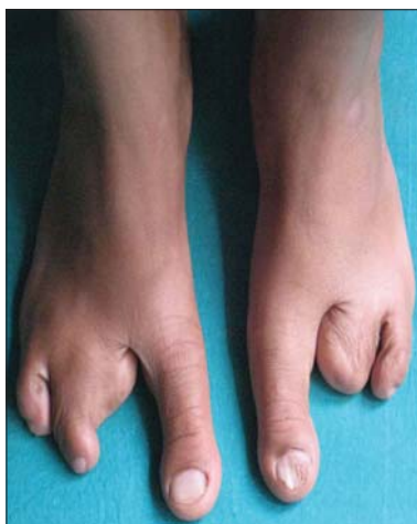
Figure 3: Feet with syndactyly, clinodactyly, and ectrodactyly of female patient