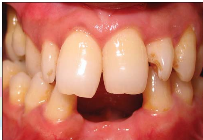
Figure 8: Intraoral photograph of female patient demonstrating missing teeth