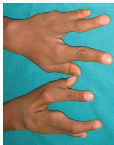
Figure 6: Congenital disorder of hands of the subject's brother