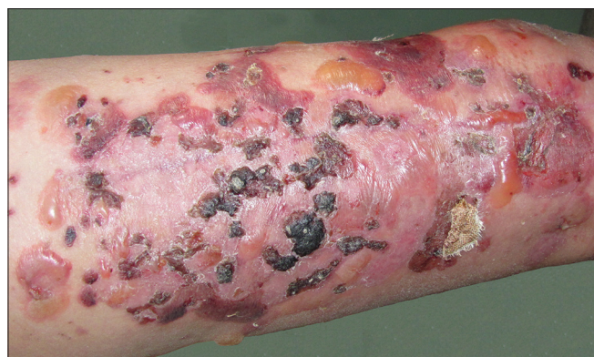
Figure 1: A large crusted pink plaque and many tense hemorrhagic bullae developing along the postsurgical scar

Results of routine blood cell count, serum creatinine and hepatic tests were normal. Biopsy showed a sub-epidermal vesicle with abundant eosinophil infiltrates in the papillary dermis [Figure 2]. DIF of perilesional skin revealed a clear band of IgG-deposition at the dermo-epidermal junction [Figure 3], and IIF of the circulating IgG antibodies to BMZ was 1:20.