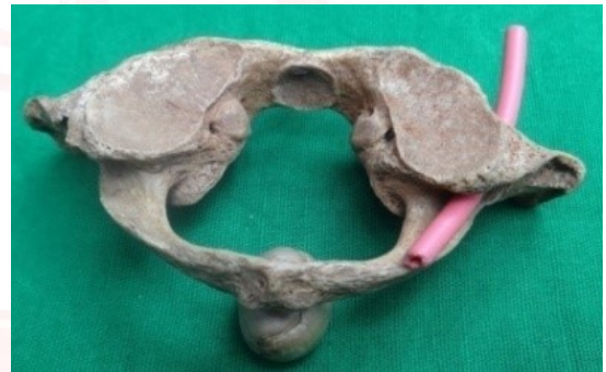
Fig. 5: Left Ponticulus lateralis of Atlas vertebra.