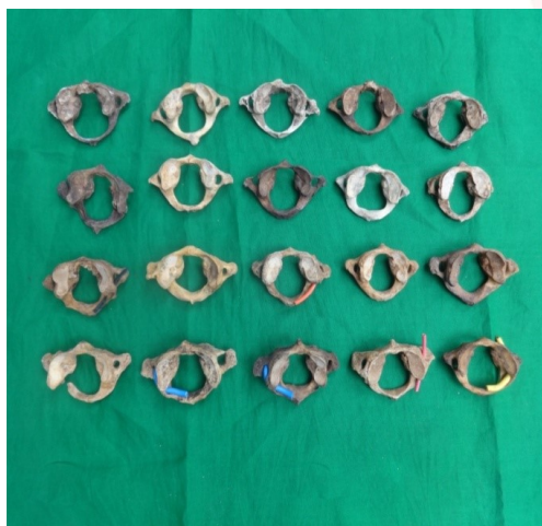
Fig. 1: Twenty (20) Atlas vertebrae showing ponticuli