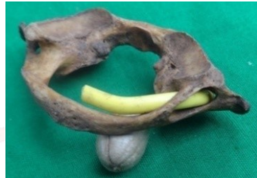
Fig. 4: Right Ponticulus lateralis of Atlas vertebra.