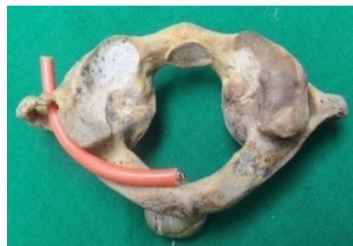
Fig. 6: Right Ponticulus posterolateral of Atlas vertebra.