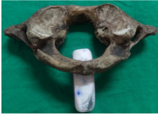
Table 1: Distribution of Ponticuli of atlas vertebra.