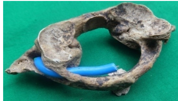
Fig. 3: Right Ponticulus posticus of atlas vertebra.