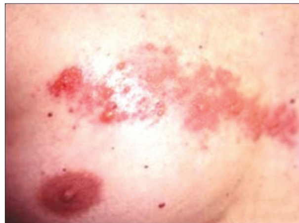
Figure 1: Papulovesicular lesions on right chest

We report a case of a 60-year-old woman presenting with zosteriform cutaneous metastasis as a primary manifestation of carcinoma breast, which was diagnosed on FNAC.