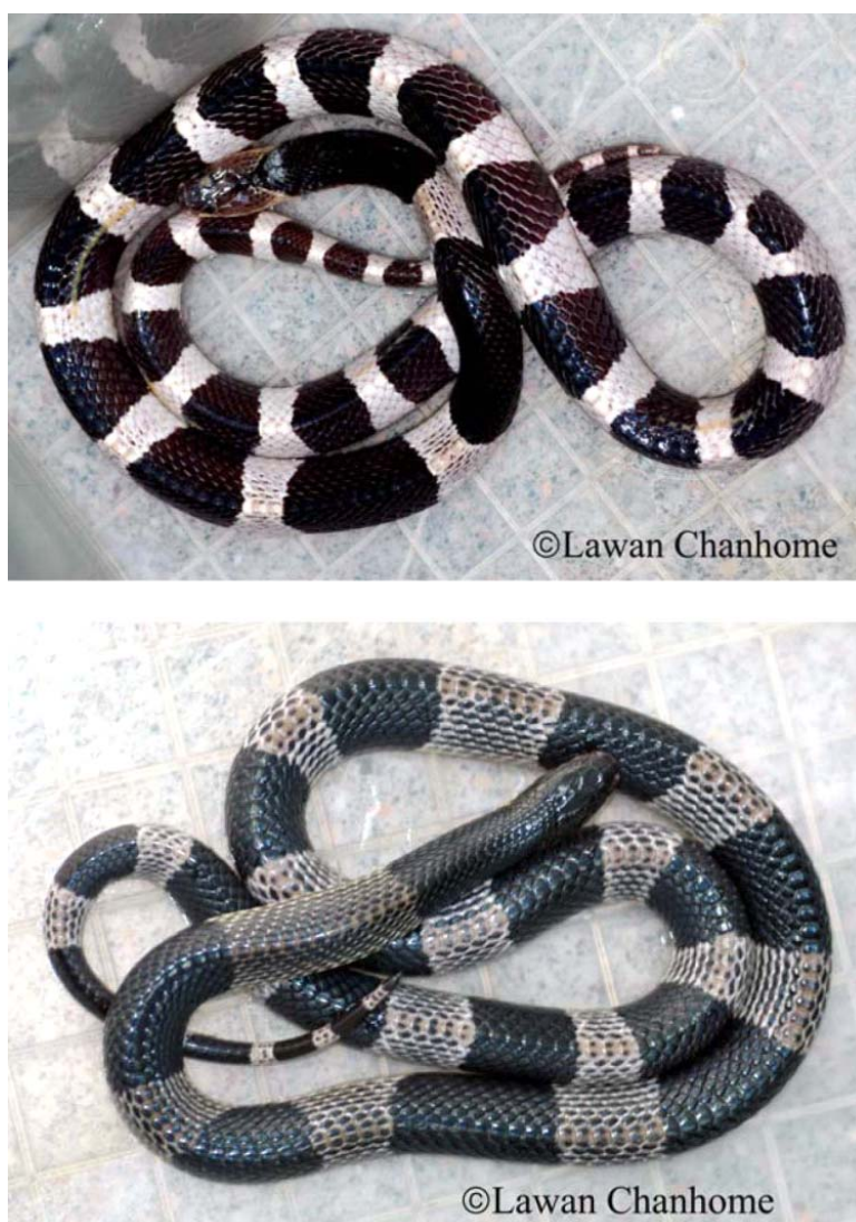
Fig. 1 Bungarus candidus snake from southern (upper) and northeastern (lower) Thailand.

creatine phosphokinase (CPK) were determined by immunoturbidimetric assay using Cobas Integra 800 (Roche Diagnostics GmbH, Mannheim, Germany). Plasma calcium concentrations were determined using the Cresolphthalein Complexone method [8].