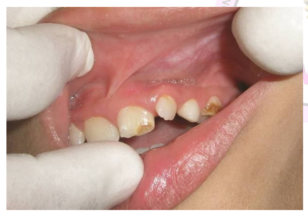
Fig. 1 Intraoral view showing buccal vestibular obliteration

On examination, intraorally, swelling extending from the left permanent central incisor to the second deciduous molar obliterating the buccal sulcus was present, about 3x2 cm in size without any extraoral findings (Fig 1)