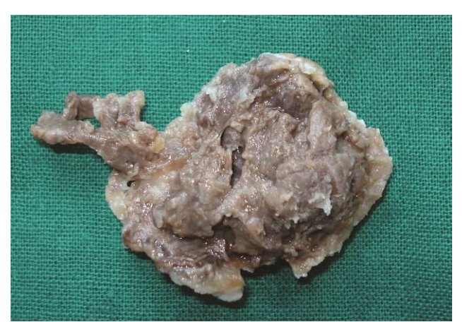
Fig. 4 Gross specimen showing well-encapsulated excised mass

Cut surface showed patchy brownish areas of hemorrhage (Fig 5).