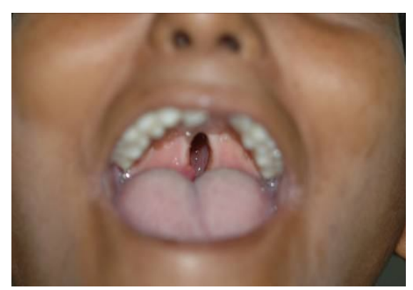
Fig.3 Incomplete Cleft Palate with normal dentition

Bilateral Hallux valgus was noticed with shortened great toe (Fig.4).