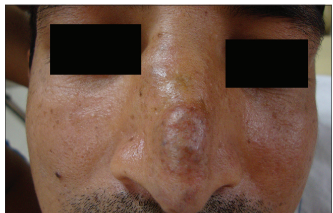
Figure 2: Skin colored to bluish swelling on the nose

Glomus tumors are thought to represent neoplastic proliferations of glomus cells which are modified