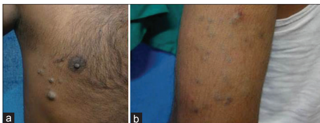
Figure 1: (a) Multiple bluish nodules over the trunk (b) Bluish to erythematous papulonodules forming a plaque over the left arm

A 30-year-old male presented with multiple bluish to dusky red plaques and nodules since 12 years of age.