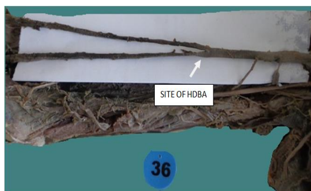
Figure 4: Specimen showing high division of brachial artery.

In the present study, high division of brachial artery was observed in one specimen (2%). After giving rise to profunda brachii artery and superior ulnar collateral artery, the artery was bifurcating in the proximal third of the arm into radial and ulnar arteries. The radial artery was crossing superficial to the median nerve and continued superficial course in the forearm. Inferior ulnar collateral artery was not found to be arising from any of these terminal branches.