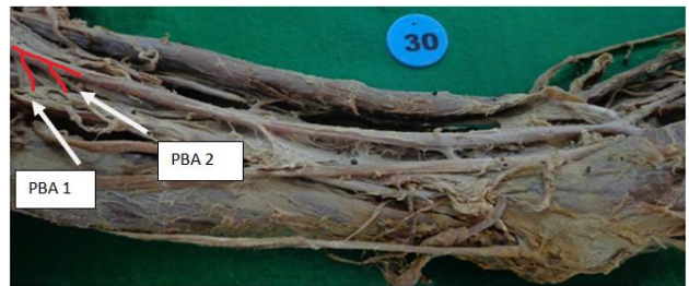
Figure 2: Specimen showing double profunda brachial artery.

In the present study, one specimen showed presence of double profunda brachii artery arising from postero-medial aspect of brachial artery accounting for 2% of the variations observed.