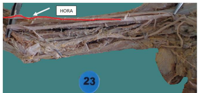
Figure 3: Specimen showing high origin of radial artery.

In the present study, high origin of radial artery was found in one specimen. It was originating from proximal one third of brachial artery and coursing superficially in the arm, crossed superficial to the median nerve and then descending laterally to it. Radial artery did not give origin to any branches in the arm.