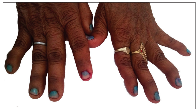
Figure 3: Showing swan neck deformity of fingers

and detection of RF is not specific for RA. Testing for anti-CCP antibody can provide additional information and, in some cases, enable earlier and more specific diagnosis. [5] One should